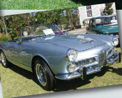
The 1997 inaugural took place at Chateau Elan, with Alfa Romeo front and center.